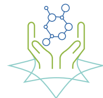
Special Edition REGENERATIVE MEDICINE AND HEALTHY AGING