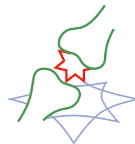
ORTHOPAEDICS/ PAIN MEDICINE/ RHEUMATOLOGY